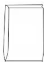
4 sides sealed bag