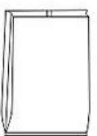
Fin/lap seal with side gusseted pouch