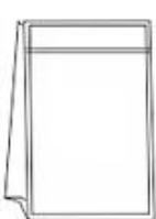
Flat bottom bag