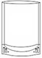
Stand up bag