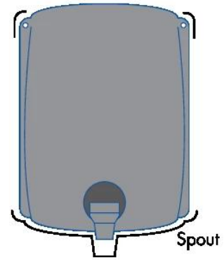
Adding additional string tie