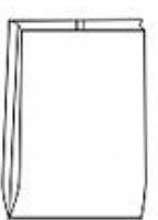
Fin/lap seal with side gusseted pouch