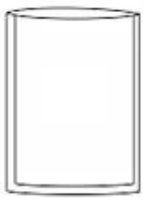
3 sides sealed bag