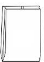
Fin/lap seal with side gusseted pouch