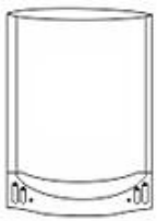
Stand up bag