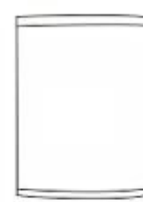
Fin/lap seal pouch