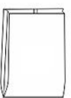
Fin/lap seal with side gusseted pouch