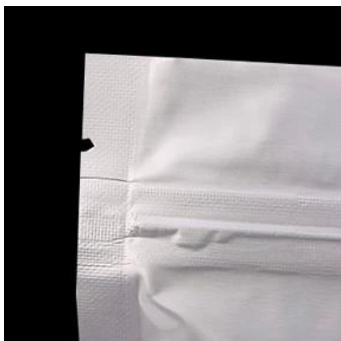
U type easy to tear