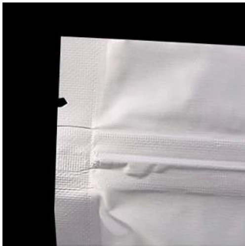
U type easy to tear