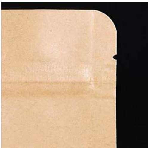
U type easy to tear