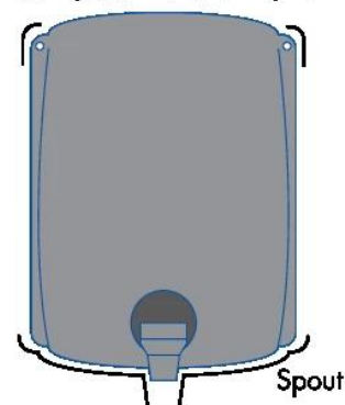
Adding additional string tie