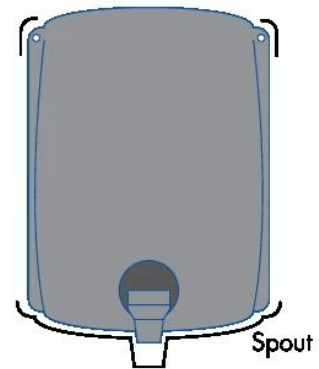
Adding additional string tie