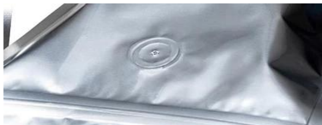
Air-Tight Closed Position

When pressure inside a sealed package increases beyond the valve opening pressure, the seal between the rubber disc and the valve body is momentarily interrupted and pressure can escape out of the package.