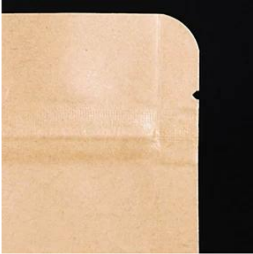
U type easy to tear