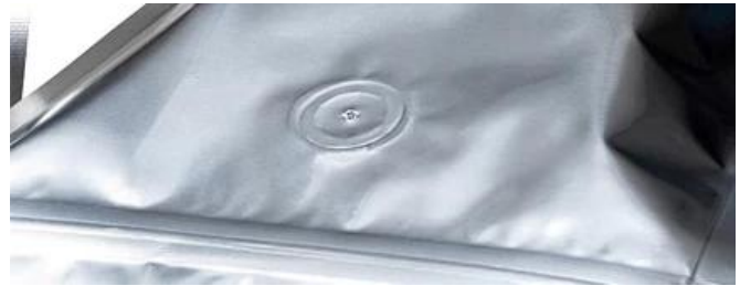
Air-Tight Closed Position

When pressure inside a sealed package increases beyond the valve opening pressure, the seal between the rubber disc and the valve body is momentarily interrupted and pressure can escape out of the package.