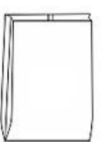
Fin/lap seal with side gusseted pouch